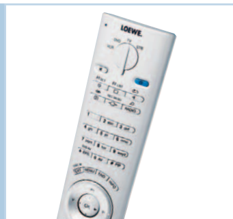
Nicely designed, but the remote remains a little fiddley