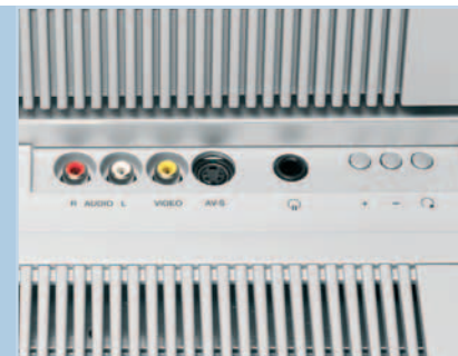
Front-panel connections are provided for easy game hook-up