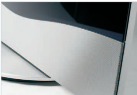
The sonics match the R 37's great picture performance

I don't think Loewe has been presumptuous in calling its new TV a 'masterpiece'. Both inside and out, it's more like a work of art than a TV ■